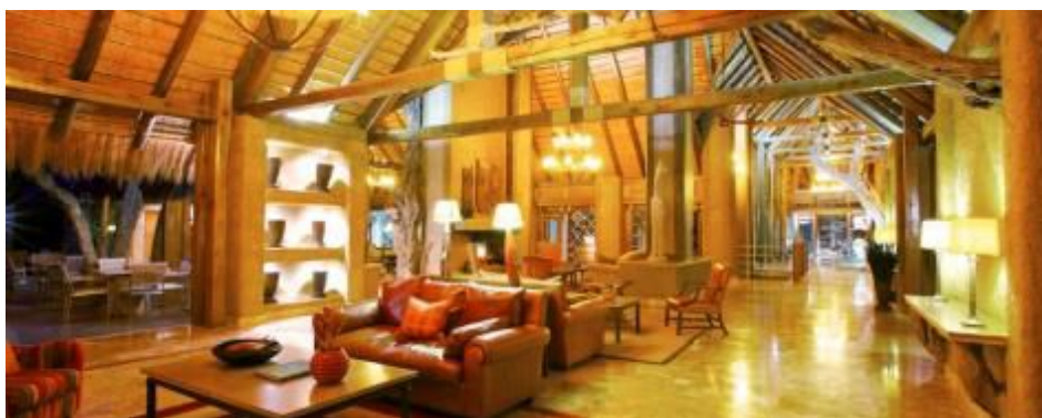
Kapama River Lodge

River Lodge's 40 spacious air-conditioned suites have uninterrupted views over the Big Five game reserve from private patios, and all feature full, en-suite bathrooms with lavish amenities replenished daily. The suites are decorated to reflect old Africa in a luxury game lodge setting. Beverage stations for early morning coffee in suite and minibars for sundowners on your private patio are standard in all rooms.